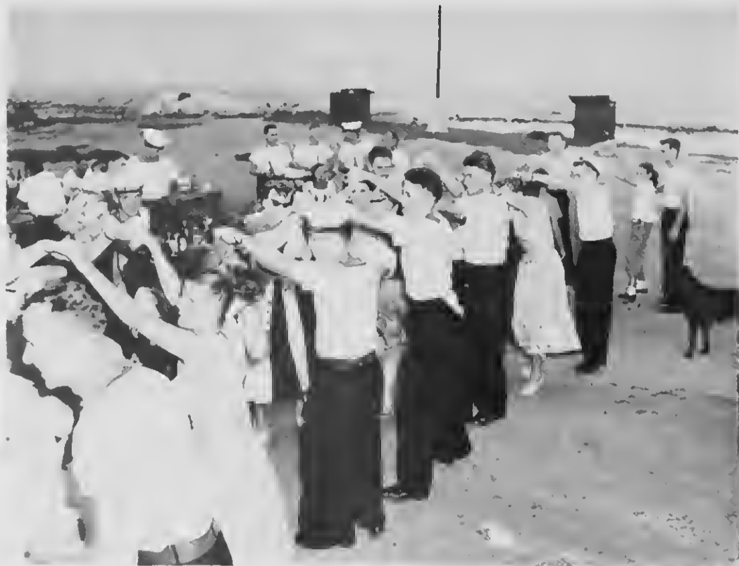
... where pretty girls and games competed with food for the sailors' attention during the afternoon.